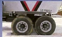
Super 19 1/2" Wide Implement Tires