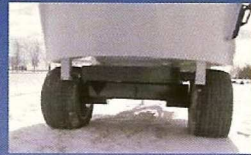
Tight Radius Walking Tandems With Implement Tires